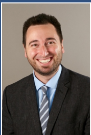
Patrick O Connor

http://www.look2homes.com/l2fp/floorplan/index.php?oid=16061